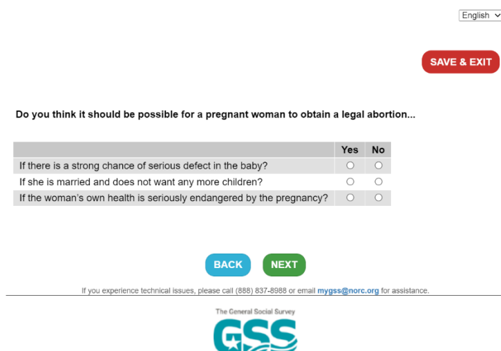
Figure 3: Example of Gridded Variables—Set 1

Additional details regarding the results of the experiment are available in GSS Methodological Report 141 .